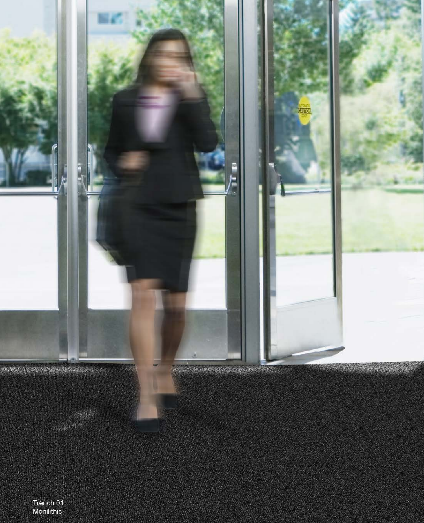
Trench 01 Monolithic

Trench is a practical & functional entrance barrier carpet tile.